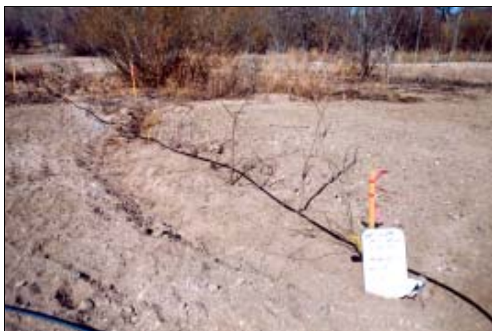
Red willows ( Salix laevigata ) just after planting. March 2002.