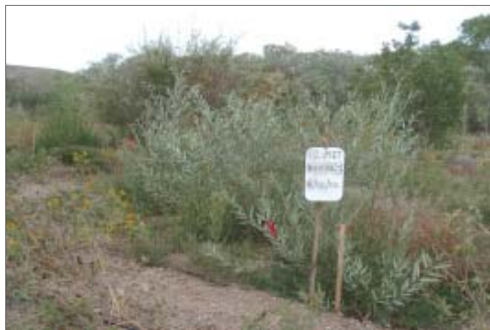
Red willows ( Salix laevigata ) after one growing season. October 2002.

The photos above demonstrate the vigorous growth of these plants during just one season. Cottonwoods and willows that were planted as "pole-cuttings" during the winter, have grown into small trees. Photographic monitoring will continue in future years to document changes at Watson Woods and to help assess the success of the Tree Planting 2002 project!