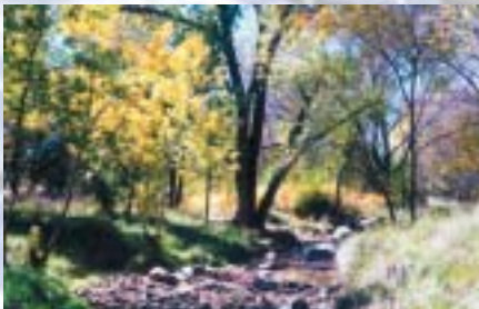
Velvet Ash at West Granite Creek Park

We educate the community about the importance our creeks and how people affect them. Community involvement and stewardship are vital to the health of Prescott’s many creeks. Our programs and projects involve the public and include collaboration with a rich cross section of partners. Prescott Creeks works with the community to focus on practical solutions to local creek-related issues.