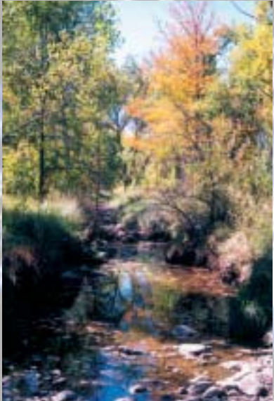
Miller Creek near downtown Prescott.