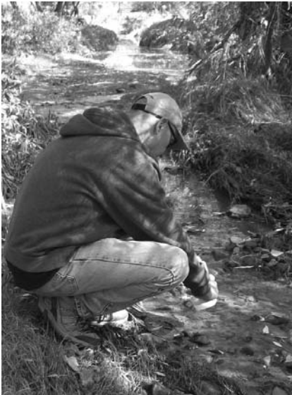
Jay monitoring Lower Miller Creek

Between December 15, 2009 and March 15, 2010, the Watershed Improvement Council conducted a survey to gather information about watershed residents' knowledge of watershed and water quality issues; perceptions of water quality; attitudes and values about protection and restoration of local water ways; and environmental behaviors. The goal was to identify gaps in